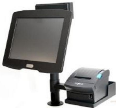
Various mounting ability for versatility and convenience

Providing Superior User Safety and Peace of Mind.